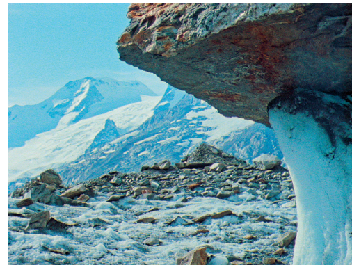
5 Laurence Favre Résistance, 2017 DCP (from 16mm Film), Colour, Sound, 11 Min.